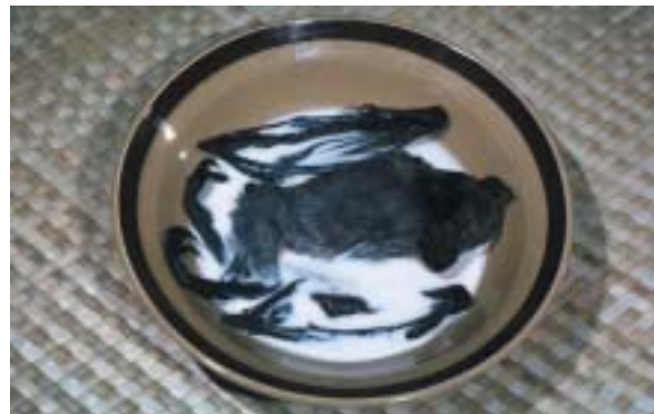
A flying fox is prepared for consumption at a Chamorro feast. The Chamorro, who are the native peoples of the Pacific island of Guam, boil the animal in coconut milk and consume it in its entirety. Research published in the March issue of Neurology conducted by a National Tropical Botanical Garden investigator suggests a possible link between plant toxins ingested through consumption of flying foxes and a high incidence of central nervous system disease in Guam.