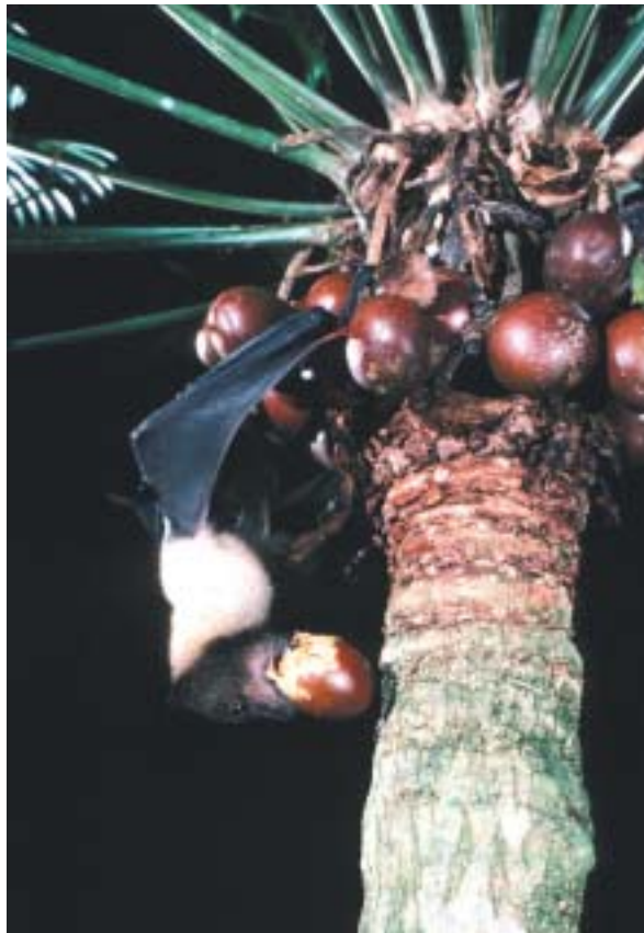
A flying fox eating the fruits of a cycad in Guam. One of the main food sources of the flying fox are the fruits of the native cycad trees which contain potent neurotoxins, chemicals that can damage nerve cells.

The disease has become much rarer, altered its presentation (as noted above) and its age of onset: back